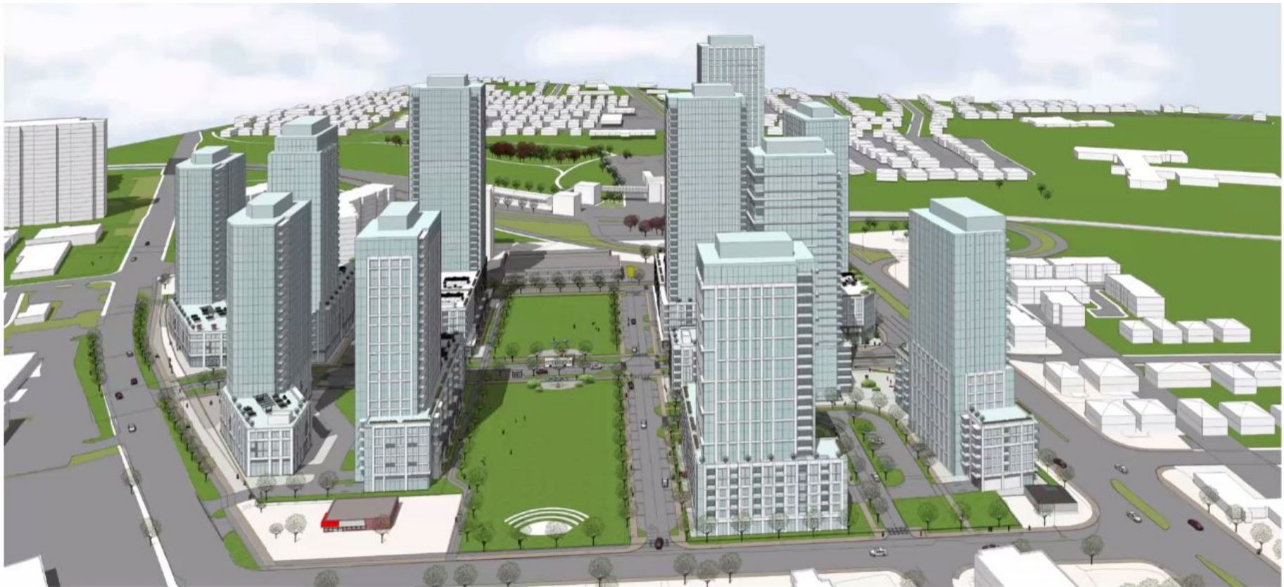
BIRD'S EYE VIEW LOOKING EAST